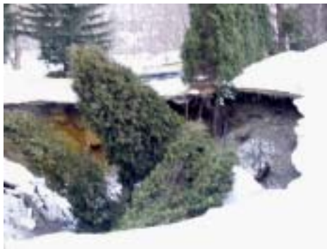
An example of subsidence in a coal mining area. When the ground gives way trees and everything else simply cave into the open space below.

water from wells and buying more than 11 million gallons from the Charleroi municipal water company. But on Nov. 12, the state DEP ruled that the creek, previously classified as intermittent, is a perennial stream. It said that entitles the creek to protection from pollution, which includes diminished flow, contained in the state's Clean Streams Law. The DEP ruling was in response to an UMCO request to reclassify the brook as ephemeral, which means it flows only when it rains. UMCO asked the state EHB to overturn the ruling, but the appeal hearings ended in denial.