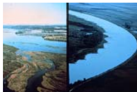
The two Missouri Rivers -- the unchannelized, more natural river on the left and the channelized barge canal on the right.

Magnuson also ruled against the coalition in an earlier set of lawsuits, which are being considered together. The earlier ruling is being appealed to the Eighth U.S. Circuit Court of Appeals. American Rivers spokesman Eric Eckl said an appeal may be possible in the latest lawsuit as well. "The ruling is a setback, but it's not the end of the line," he said. Environmental groups wanted to see lower summer flows in the River to help the endangered fish and birds — the Missouri River's natural state is very wide and shallow.