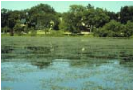
Typical Eurasian water milfoil infestation.

The discovery only makes the job of controlling Eurasian water milfoil, and perhaps the hybrid, more difficult, according to Ron Martin, aquatic invasive species coordinator for the DNR. That's because the hybrid is virtually impossible to differentiate from the Eurasian water milfoil, he said. One way to tell the difference — spend about $50 for DNA analysis.