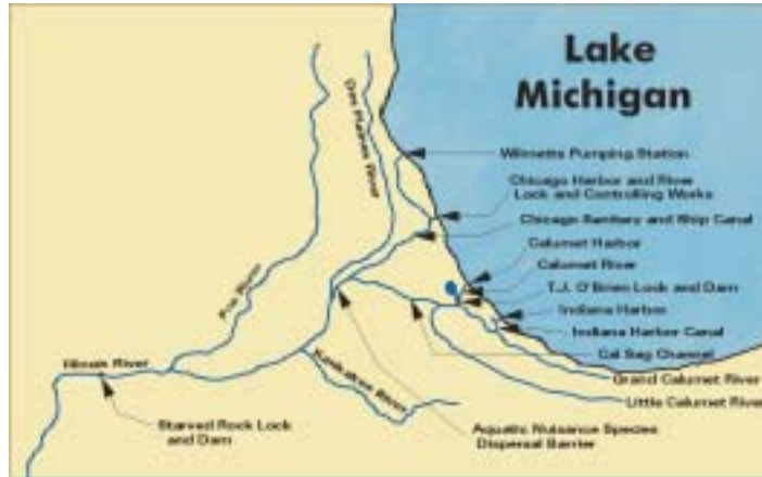
Map showing location of the electrical barrier and some of the complex connecting channels between Lake Michigan and the Mississippi River Basin via the Illinois River.

avenues for Asian carp invasion of the Great Lakes exist. The Dispersal Barrier Advisory Panel (DBAP) has considered the risk of Asian carp spread in conjunction with two other "connections". When the Des Plaines River floods, occasionally water from that river flows overland into the Sanitary and Ship Canal upstream of the existing dispersal barrier.