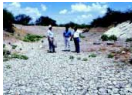
CAR photo. Dry stream bed.

donations of water rights to be used for instream purposes.