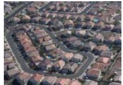
CAR photo. Urban sprawl.