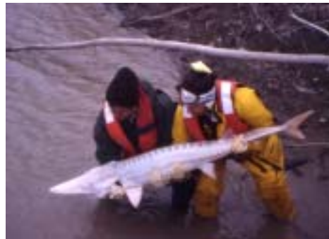
Pallid sturgeon recovery operations on the Missouri River.