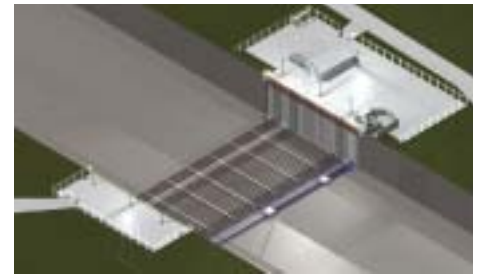
Early diagram of the electric Aquatic Nuisance Species barrier in Chicago.