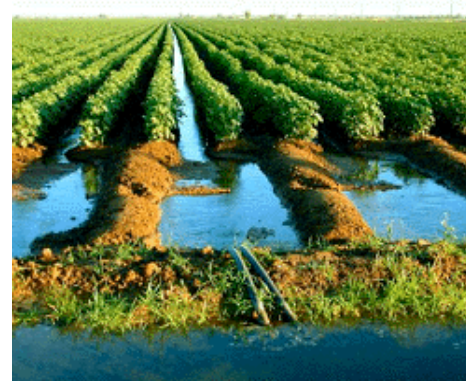
Typical irrigation operation

The Bush Administration announced in late December that U.S. taxpayers will pay four California irrigation districts $16.7 million for water that was diverted from agriculture in 1992 and 1994, when a long drought threatened the survival of the area’s chinook salmon and delta smelt populations. Property rights advocates hailed the settlement, and some legal experts said the pact will make it harder for the federal government to protect endangered species.