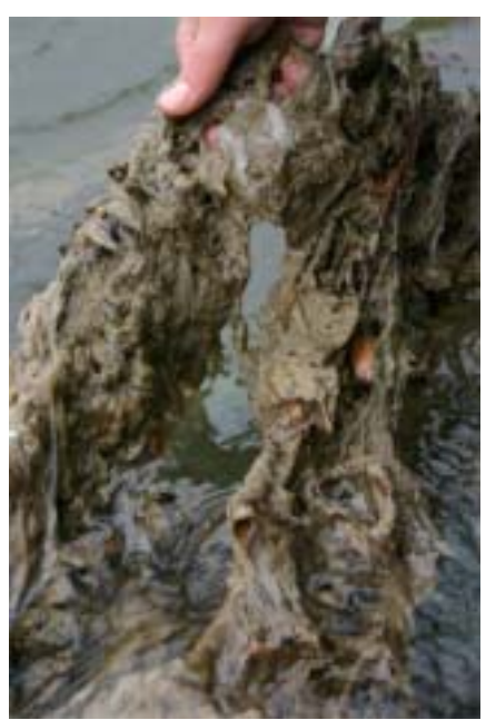
Didymo attached to a stick in the river.

Didymo is no laughing matter to biologists and fishermen who are watching its steady spread. Didymo is short for Didymosphenia geminata , a one-celled freshwater diatom (type of algae) that clings to river bottoms and develops brownish-white mats of trailing moss-like material that blankets rocks and smothers plants. One angler described it as looking like wet toilet paper. Other nicknames are less than endearing — bubble gum, cotton candy and (snicker) rock snot. No matter what you call it, it's a mess.