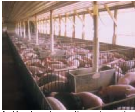
Inside a large hog confinement operation.

Farms with large livestock operations that discharge into waterways must apply for wastewater permits, under rules proposed in late June by the U.S. Environmental Protection Agency (EPA). The proposed regulations, which come in response to an appeals court ruling last year, would revise National Pollutant Discharge Elimination System (NPDES) permitting requirements for concentrated animal