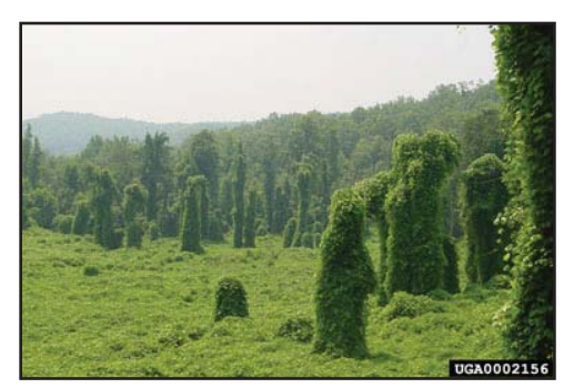
Kudzu infestation

As for kudzu, it is native to Asia and was introduced to the U.S. at the Philadelphia Centennial Exposition in 1876. In the 1930s, the U.S. Soil Conservation Service began encouraging use of the vine as a means of controlling erosion. Since then it has grown aggressively in the South, known for smothering everything in its path – from other plants to fences and buildings. Experts said an infestation can be controlled by cutting the vine down or allowing animals to graze on it. But killing it for good requires chemicals.