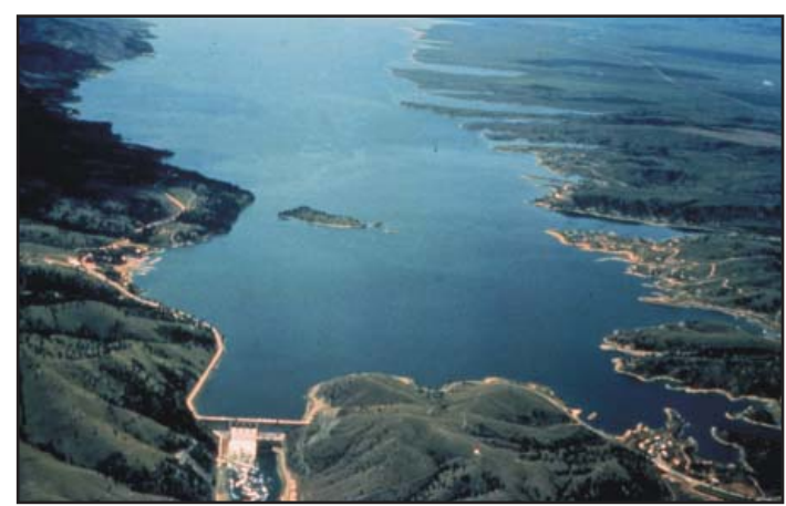
Gavins Point Dam and Reservoir, SD.

Two years later, with another drought at hand, the Corps lowered the lake levels six feet and disrupted boating on the lakes for a year. But in 2004, when state officials and Perry Lake residents complained, the Corps agreed to allow the lake level to rise 2.2 feet above normal – sort of a reverse rainy day – and use that water, if needed, for Missouri River navigation. But it could only be granted for one year at a time, officials said.