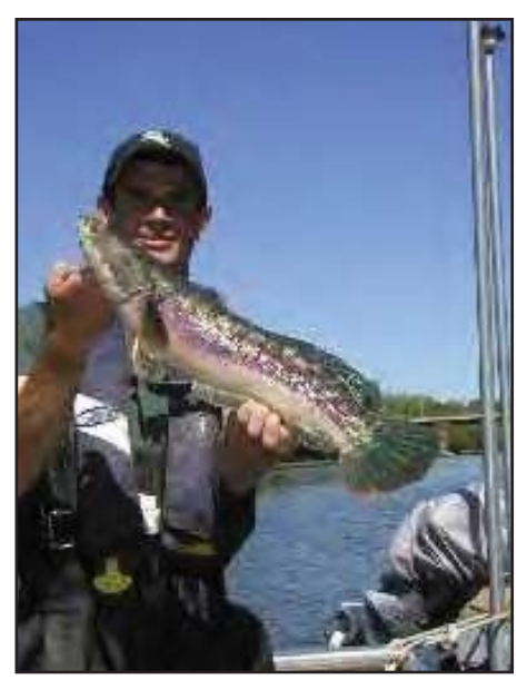
Snakehead captured in the wild in Wisconsin in 2004.

Ip pleaded guilty to a misdemeanor count of illegal commercialization of fish and wildlife in New York's Erie County Court. He also pleaded guilty in U.S. District Court to violating the Lacey Act for transporting snakeheads from Canada into the U.S and in Canadian courts for violating two Canadian wildlife conservation and trade laws. The snakehead, a fish from Asia and Africa that can grow up to 3 feet long, is a voracious predator that can harm native fish. It is illegal to possess, sell or transport them in many states, including New York, and across state lines.