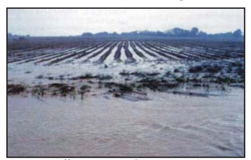
Farm runoff can carry sediments, nutrients and pesticides into surface waters

• a Community Outreach Toolkit , designed to help watershed groups, non-governmental organizations, states and federal partners educate the media about nutrient pollution;