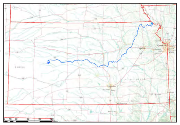
Route of the Proposed Kansas Aqueduct

(1,800 feet) over its 375-mile course to the High Plains. The water would be drawn from wells drilled next to the Missouri River, but be designed to divert water during flood stage. As much as 4.9 billion cubic meters (4 million acrefeet) of water could be moved each year, though less than half of that – 2 million cubic meters (1.6 million acrefeet) or roughly 5 percent of the river's average annual runoff – would be a firm supply, Rude said. One acre foot equals 326,000 gallons. A terminal reservoir to hold the water would also be needed, as well as secondary canals to move water from that reservoir to users across the region. These secondary canals were not included in the $3.6 billion construction cost from the 1982 study, which also estimated an annual operating cost of $413 million. Rude acknowledges that the days of deep federal investment are probably over. Farmers, who now pay only for the energy to pump water, and other local users will have to shoulder the cost, and that represents the chief uncertainty for the project.