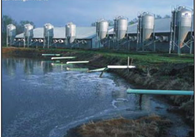
CAFOs generate tremendous amounts of pollution.

States, meanwhile, have taken action to scale back CAFO regulation. Ohio