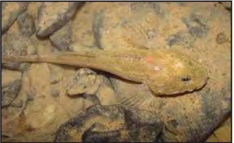
Grotto sculpin