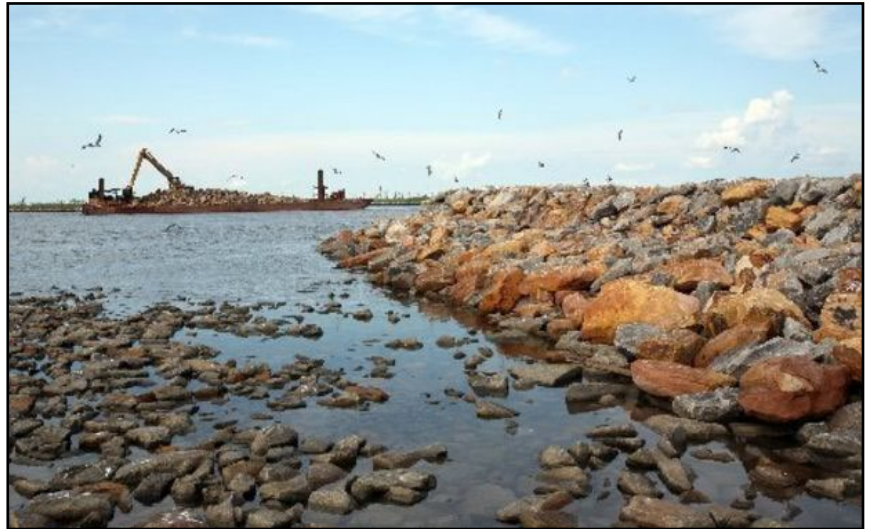
Construction of a rock dam closure for the MRGO channel.

Until post-Katrina improvements to West Bank levees were completed, the Corps continued to pay the full cost of operation and maintenance of that levee segment, as required under several earlier water resources bills dating back to 1999, he said. But when a post-Katrina supplemental appropriation included language requiring a 65-35 percent share of the cost for most post-Katrina levee improvements, the Corps contended that provision also applied to the Algiers Canal levee. When the Corps recently announced that they're ready to turn over the Algiers Canal and other West Bank levees to the state and the Southeast Louisiana Flood Protection Authority-West as complete, it sent the state a letter "guidance" saying the agency was no longer responsible for operation and maintenance costs.