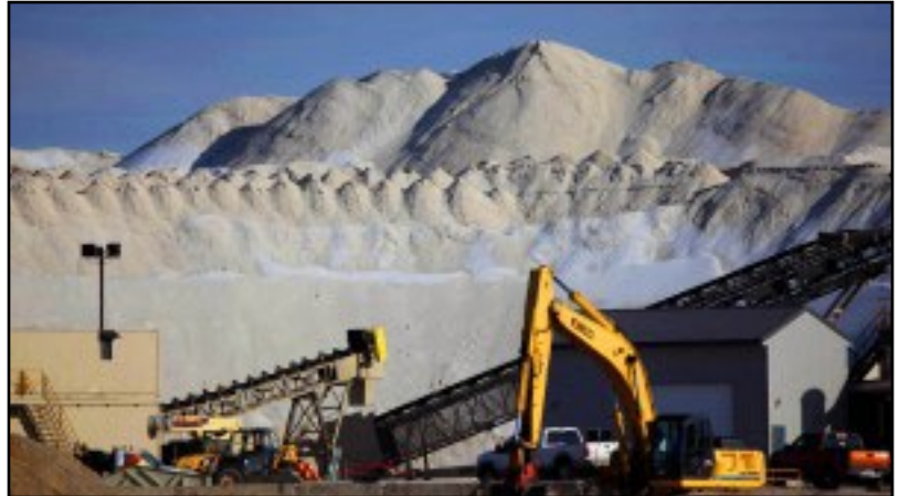
Typical large Wisconsin sand mine.

The case is the third involving a sand mine since mid-December. Altogether, the parties have agreed to pay $360,000 to settle. The sand mining industry has grown sharply in recent years with the surge in hydraulic fracturing or fracking where the sand is used. But with that growth, some companies have run afoul with state environmental laws, and the Department of Natural Resources has referred six pollution cases targeting the industry to the Justice Department, and three referrals have come since August. Western Wisconsin sand has the characteristics that the oil producers seek for fracking.