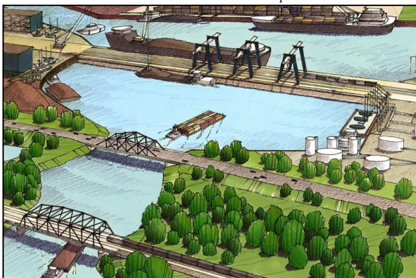
Diagram showing how a hydrologic separation along the Calumet River (top) could still allow for transfer of cargo and shipping along the CAWS (bottom). Sketch taken from the GLC Study Report.

In early February Rep. Candice Miller (R/MI) introduced H.R. 4001, the Defending Against Aquatic Invasive Species Act of 2014 . If passed, this legislation would direct the Corps to create a physical barrier between the two watersheds. “...I believe total separation is the only way to make sure that Asian carp do not enter the Great Lakes,” Miller said in a press release. “This project will require the buy-in of stakeholders from across the