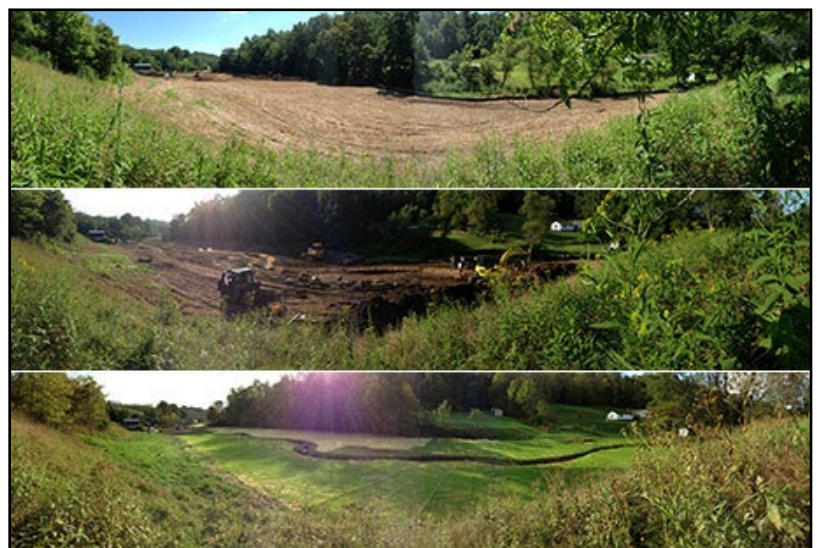
Before, during and after views of the Grave Creek mitigation site east of Cameron, WV developed as mitigation for a construction project.