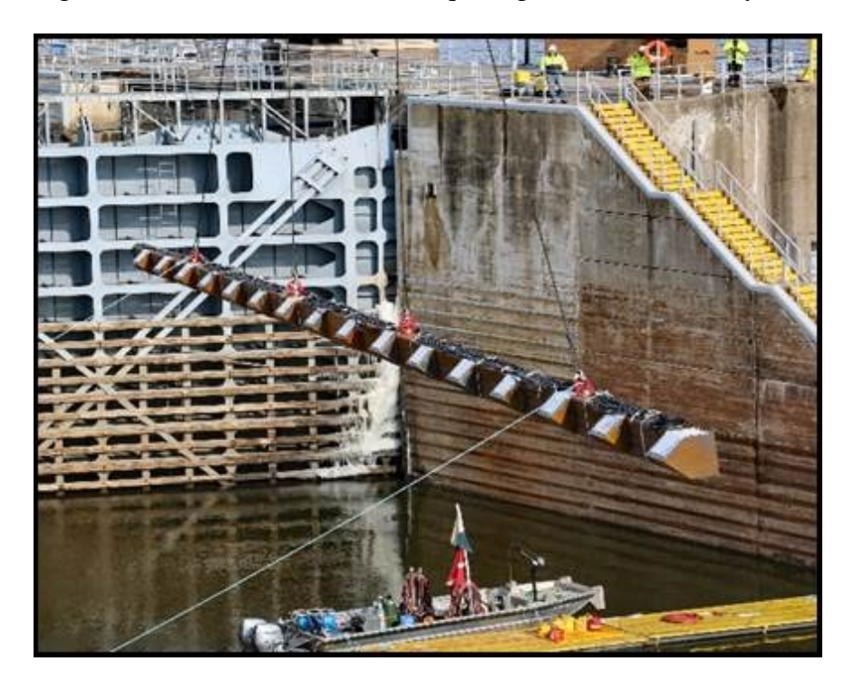
Figure 2. Photo of the uADS speaker soundbar during deployment at Lock 19 (Photo by Mark Cornish, USACE).